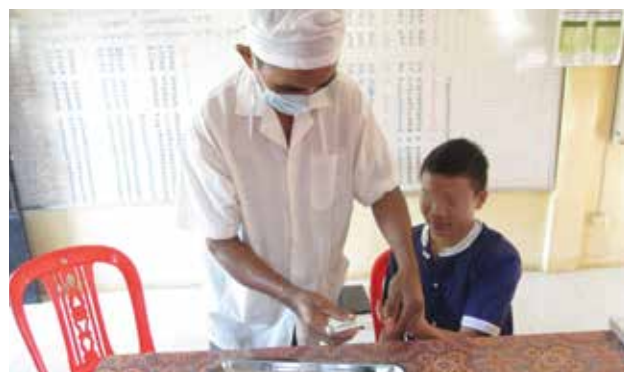
Prisoner in Preah Vihear prison got HIV/AIDS blood testing at Preah Vihear prison health post

Caritas works together the Ministry of Health and Ministry of Interior and in-line departments at the sub-national levels to implement the program. Other key partners include the UN agencies such as World Health Organization (WHO) and NGO partners such as LICADHO.