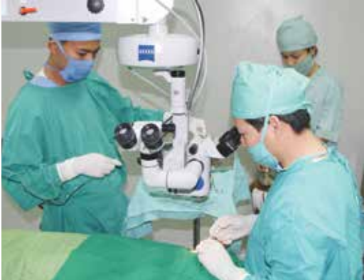
The performent cataract operation at Caritas Takeo Eye Hospital

Caritas's Comprehensive Eye Care program has been the single largest eye care program in the country since 1997. The program which is based in the government hospital in Takeo province, works to combat blindness, restoring sights through education, counseling, treatment and surgery.