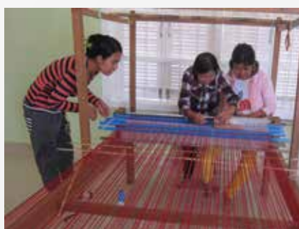
11 / Friendly Vocational Skill Development for Women and Young Mothers with Children