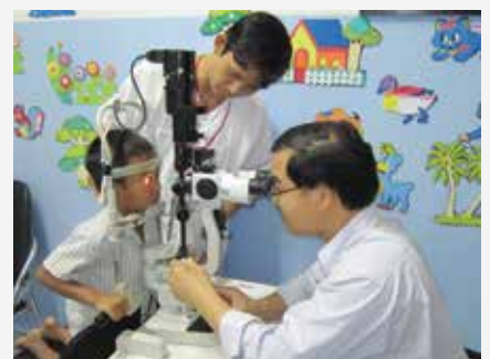
6 / Preventive Eye Care