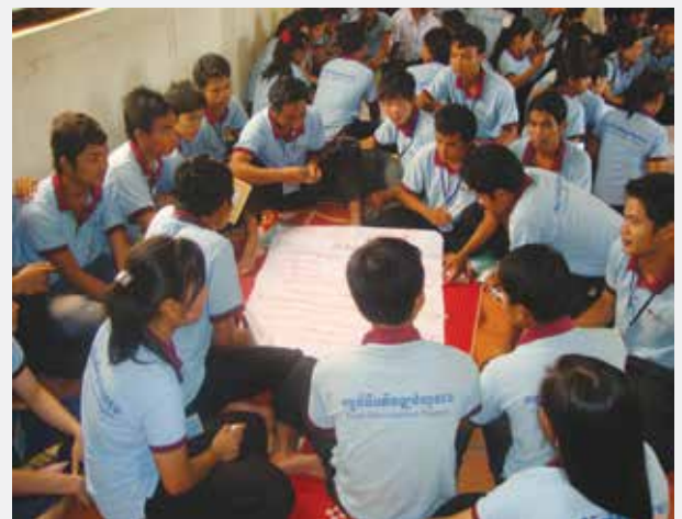
Students were attending the forum on human trafficking

80 of 111 students received jobs after completion of their courses. There are 6 of them employed with non-governmental organizations (NGOs), other 73 students work with private sectors and 1 student opened a barber shop.