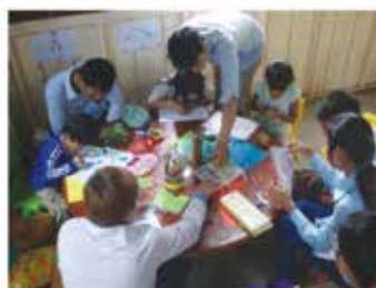
ការស្រាវជ្រាវ (Research)