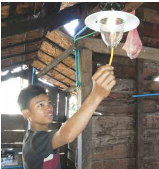
A farmer in Dambok Kpos village, Siem Reap province, generated electricity at his home from biogas.

A six- year program (2013-2018), supported by German Ministry for Economic Cooperation (BMZ), and is piloted in 10 villages in 7 provinces across the country: Kandal, Kampong Thom, Kampong Cham, Mondolkiri, Preah Vihear, Siem Reap and Battambang province.