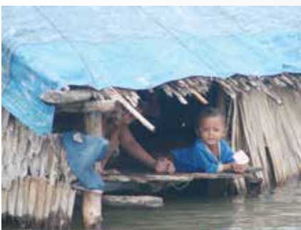
7 / Emergency Response Preparedness and Rehabilitation