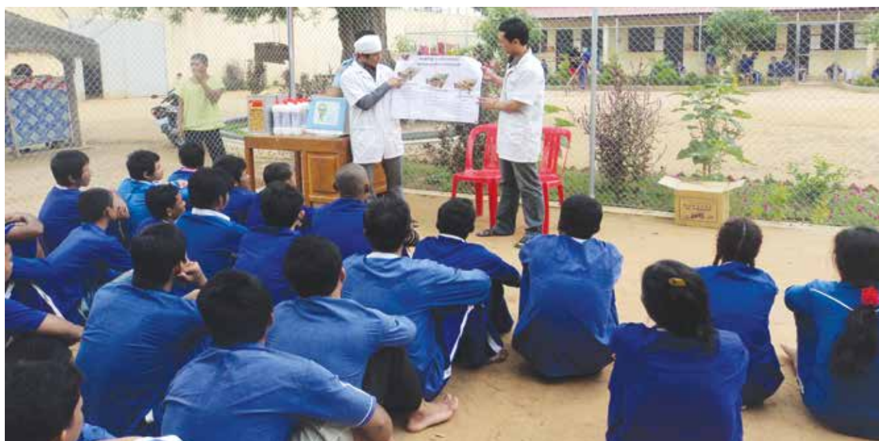
Providing health education to prisoners