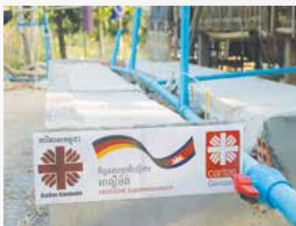
8 / Measure for Adaptation to Climate Change