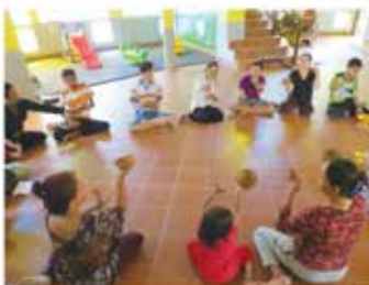
ការព្យាបាលដោយវិទ្យុសិល្បៈ (Art and drama therapy)