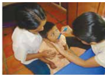
ការព្យាបាលភាសា (Speech therapy)