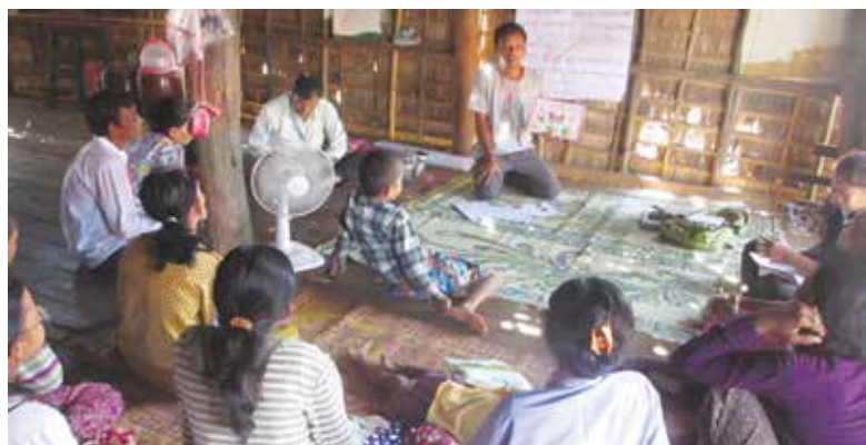
Community awareness on general health and HIV/AIDS conducted by HIV/AIDS Self-Help Group leader in Kralanh district, Siem Reap province.

Under the reporting period, Caritas implemented three major activities namely Community Based Prevention Care and Support; Livelihood and Income Generation Activities; and Vocation Training Center (Bridge of life).