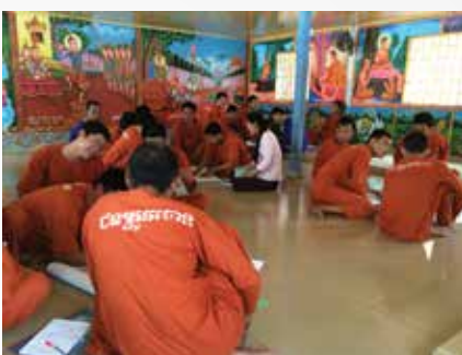
4 / Comprehensive Prison Health Care