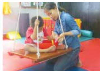
ការព្យាបាលដូចជាប្រើចាំថ្ងៃ (Occupational therapy)