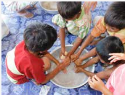
2 / Community Health