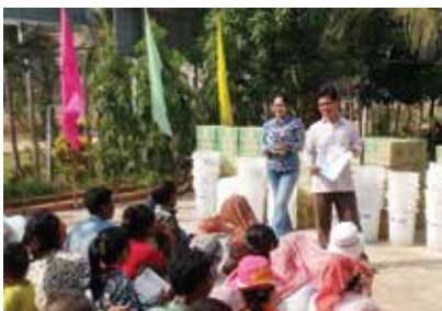
Provision of water filter in Kampong Thom province