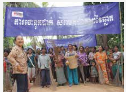
9 / Advocacy, Gender and Networking