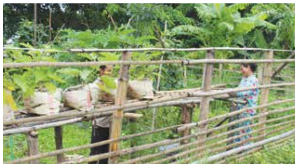
Farmers practiced vegetable farming by maintaining water storage as an adaptation to climate change.