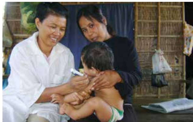
Expand Immunization Program (EIP) to women and children less than 1 year old to reduce maternal and child mortality and morbidity.

Community health program focuses on capacity building, maternal and child health care, provision of nutritious food to women and young children, kit support on hygiene and sanitation, awareness raising, linkage people to public health services and information sharing on the preservation of people's health.