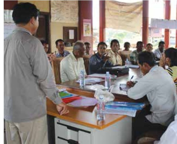
Village Development Association meeting with the commune authority

Community development seeks to empower individuals and groups of people with the skills they need in order to manage their local development projects within their communities. The strengthening of the grass root structures (VDAs) is essential to the sustainability of the project. As of 2014, a total of 138 VDAs were empowered through a wide range of trainings and workshop and 7 Agriculture Cooperative (AC) were established. A total of 576 community leaders capacitated on the governance related skills and 14,937 community members attended the awareness education on social issues such as on child rights.