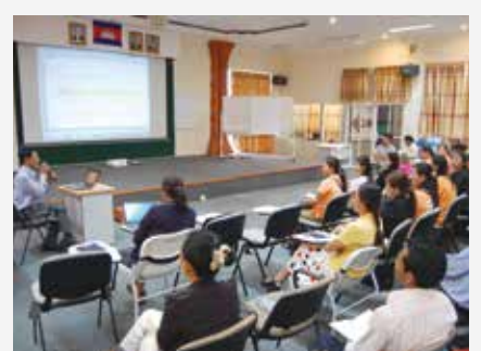
12 / Institutional Capacity Development