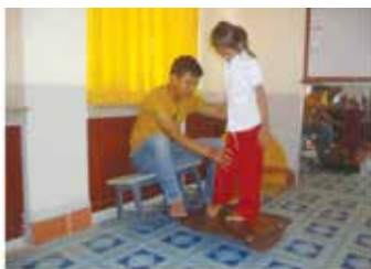
ការព្យាបាលដោយចលនា (Physiotherapy)