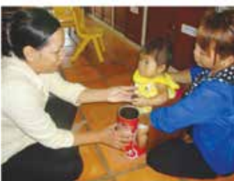
ការប្រើប្រាស់ឧបករណ៍ជំរុញដំបូង (Early stimulation)