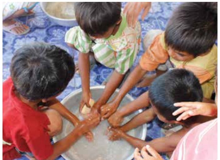
Education on how to wash hands properly for the prevention of infection and diseases

The program is one of the most long-term food security investments, leading to improved food security and nutrition. The goal of the program is to empower people in order to enable them to take self-control, use and improve their livelihood assets to enhance social and economic justice for a brighter future. There are four main project components, namely empowerment, livelihoods, infrastructures and education.