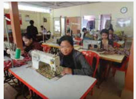
3 / HIV/AIDS