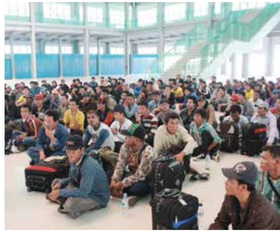
Thousands of Cambodian migrant workers were deported to Cambodia through Poi Pet Cambodia-Thai border in Banteay Meanchey province.

In 2014, thousands of Cambodian migrant workers were forced to return Cambodia by Thai military regime. Caritas Cambodia partnered with key Ministries, partner organizations including the UN International Organization for Migration (IOM) worked to support them. In terms of immediate needs, Caritas provided humanitarian support kits to the families with special focus on migrant women and children. We also worked with the Ministry of Labor and Vocational Training and the National Employment Agency (NEA) in raising awareness about skills that provided by the government, job availability and key information.