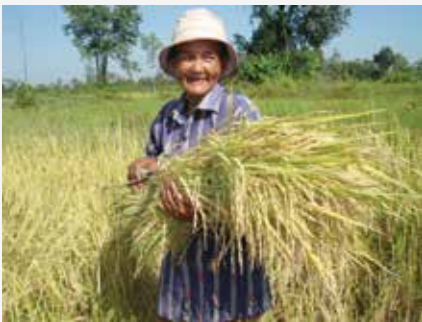
1 / Integrated Community Development