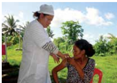
Outreach activities in Battambang province