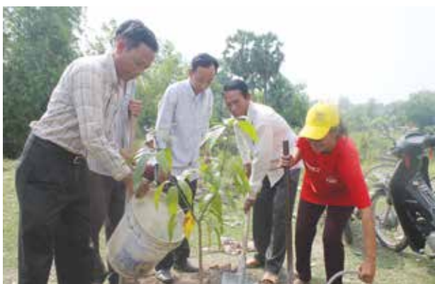
Planting trees helps to mitigate the effect of climate change. In Kandal province, local authority, key farmers and caritas staffs conveyed this message and planted tree around the community on the occasion of the celebration of "No Pesticide Use Day".