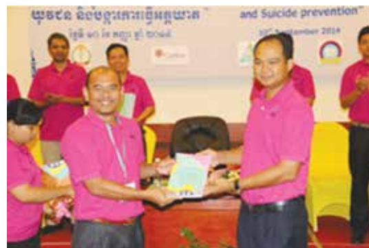
CCAMH and the Union Youth Federations of Cambodia launched an 'Activity Manual for the Teachers on Health Promotion Using Life Skills Approach'