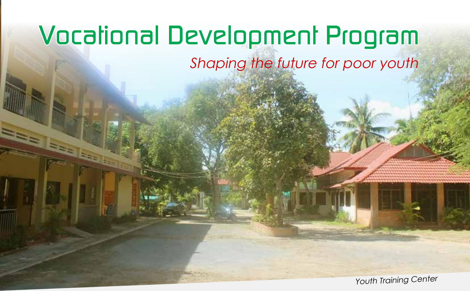
Youth Training Center