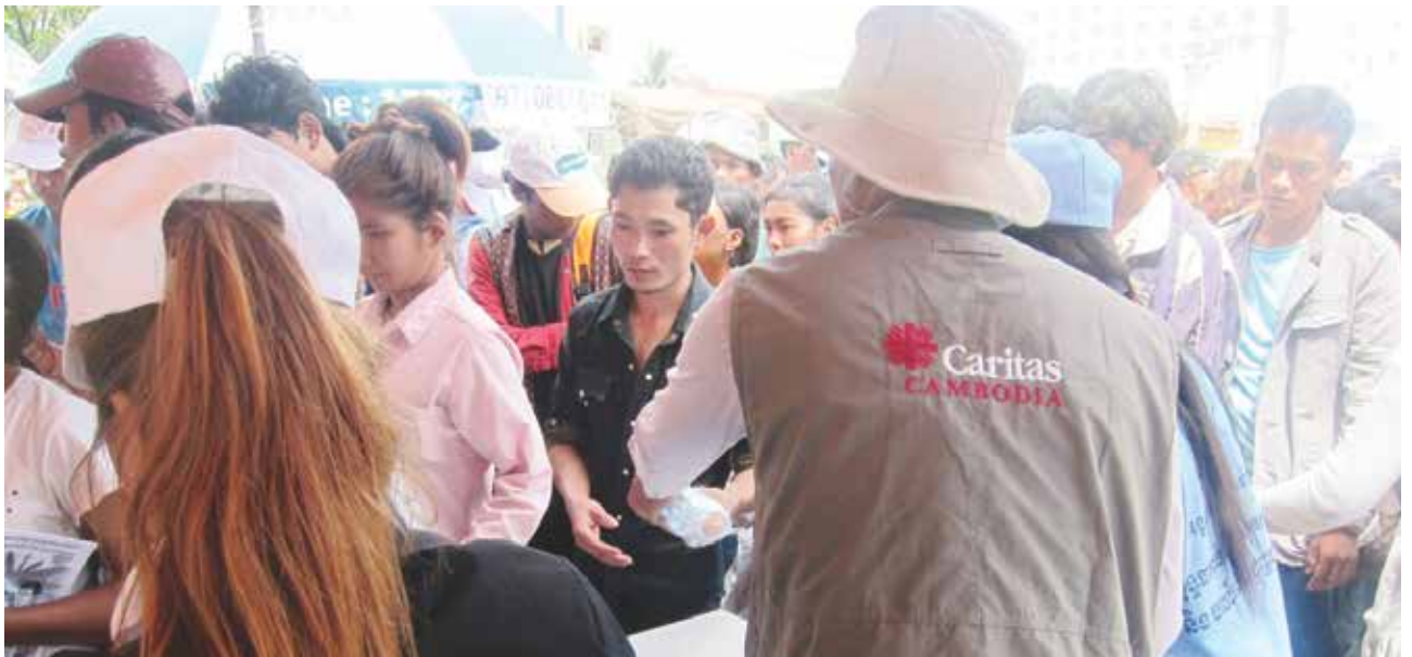
Caritas provided emergency response for migrant workers who were returning from Thailand