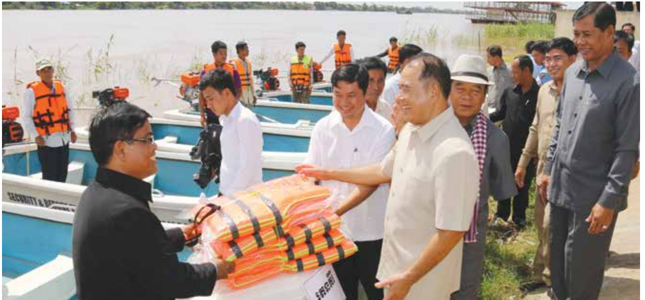
Distribution of rescue boats to provincial committee for disaster management