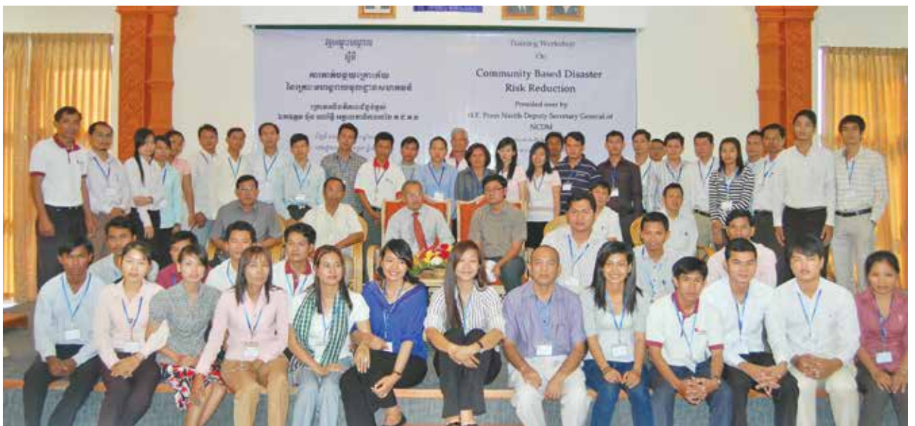
Caritas staff and partners took part in a training workshop on "Community Based Disaster risk Reduction"