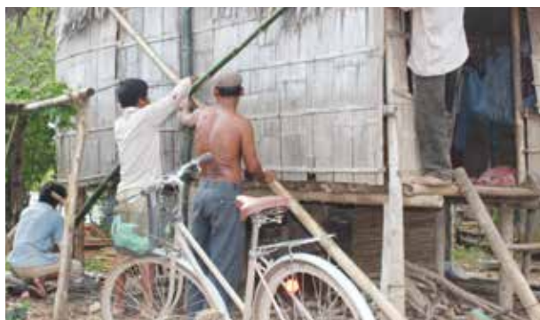
Community members in Kampong Thom province worked together to strengthen a home to make it more resistant to storm.