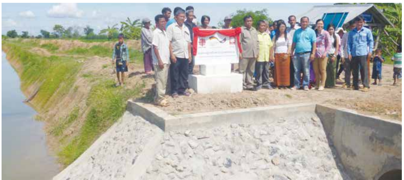
Inauguration ceremony of canal in Battambang province

To help mitigate the effects of climate change, Caritas Cambodia implemented a project "Measure for Adaptation to Climate Change", with the aims to help to strengthen the ability of Cambodia's rural population to adjust to and prepare for a future increase in climate-related disasters.