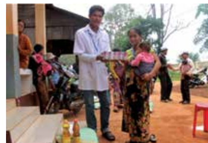
Provision of nutritious food to indigenous families in Mondulhiri province