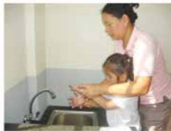
ការប្រើប្រាស់កម្មវិធីសម្រាប់ប្រើចាំថ្ងៃ (Activities for daily living)