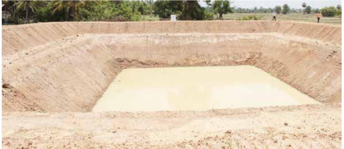
Supporting the construction of water pond in Siem Reip province

The Community Development Programme has supported communities in infrastructure development. Caritas works to mobilize local resources and support to build, renovate community assets such as road, bridge, and canal water well, water gate and other physical infrastructures. A total of 280 small scale irrigation system including water well, solar water pump, community pond and latrines have been built and renovated.