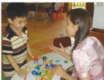
ការរៀនសូត្រ (Remedial education)