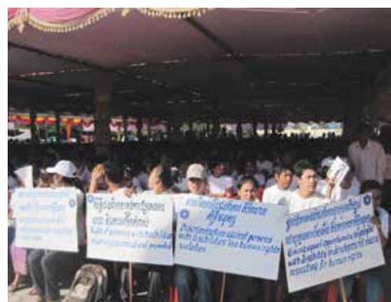
To celebrate the Human Rights' Day, Caritas Cambodia joint with civil society groups on the occasion of the International Human Rights' Day which gathered approximately 5,000 people