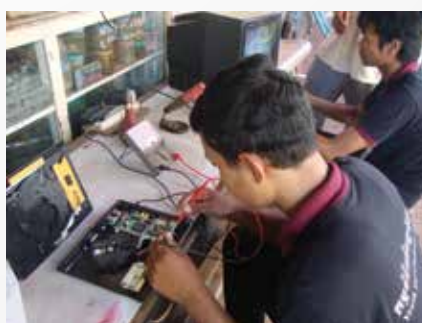
10 / Vocational Skill Development Program