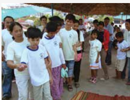
5 / Center for Child and Adolescent Mental Health (CCAMH)