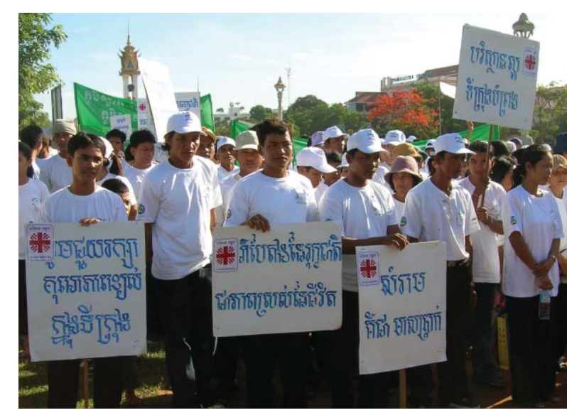
World Invironment day