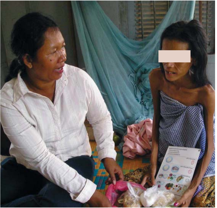
Therapeutic feeding to TB-HIV