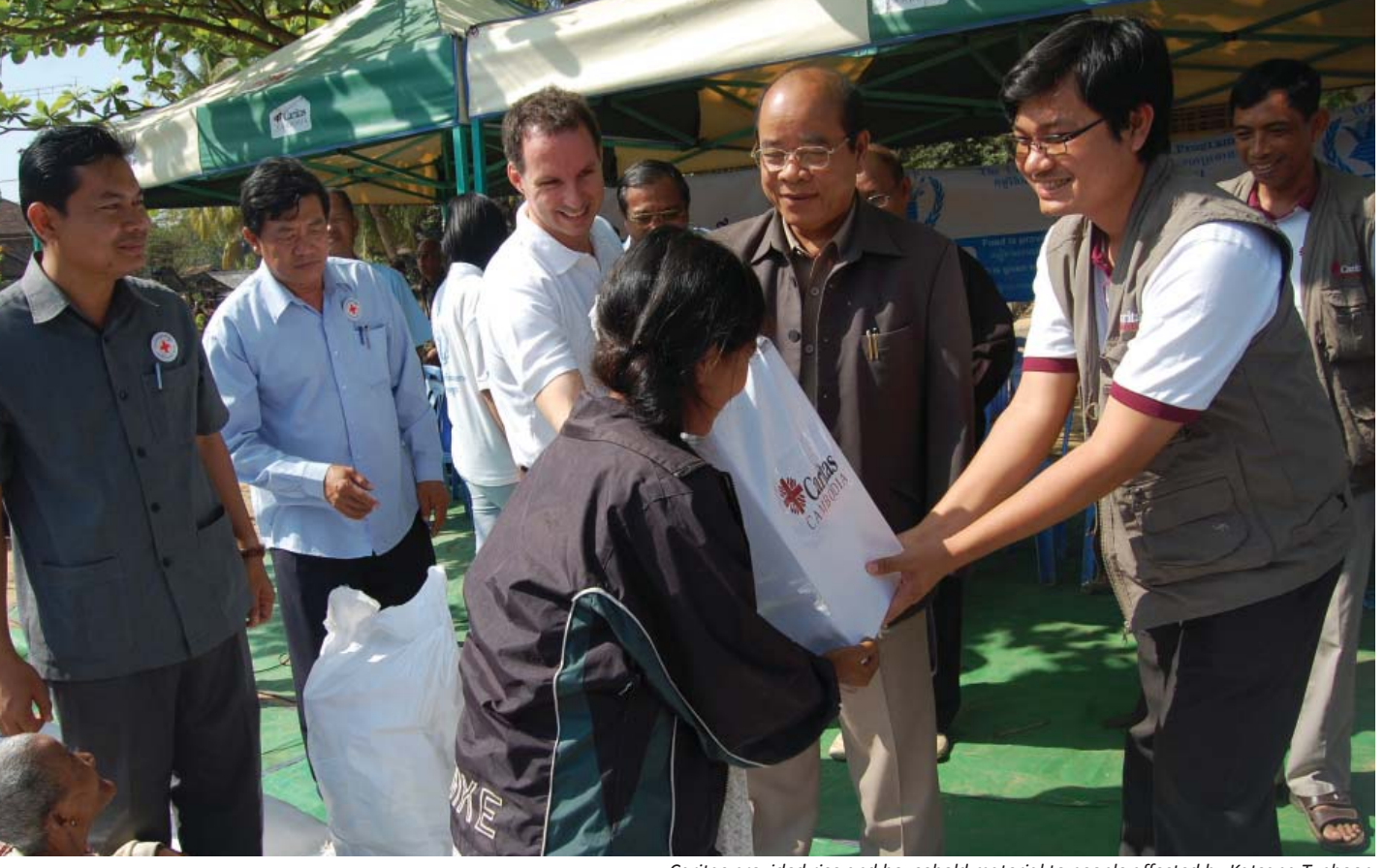
Caritas provided rice and household material to people affected by Katsana Typhoon

Caritas helps people impacted by floods and other disasters.