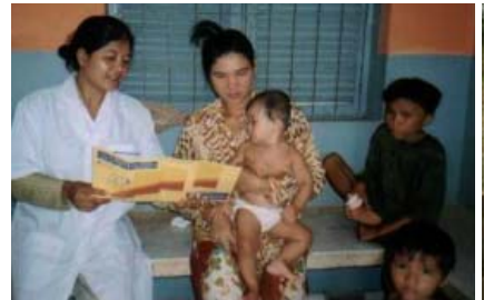
Education at P.Sneng HC