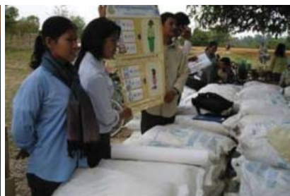
Nutrition education and food distribution