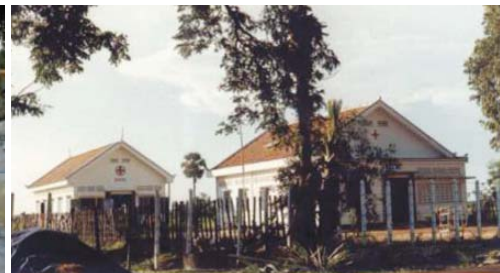
HC Kantreang + TB clinic built by Caritas